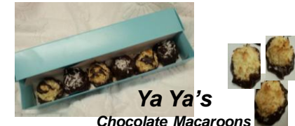
Ya Ya's Chocolate Macarons $6.00 / 1/2 Dozen