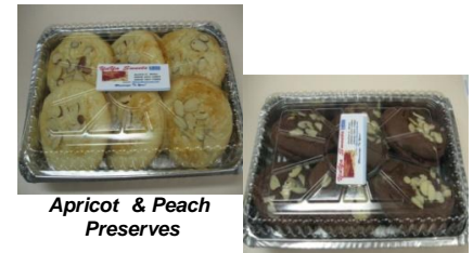
Apricot & Peach Preserves

Ya Ya's Almond Sandwich Cookies $7.49 / 1/2 Dozen or $ 14.50 / Dozen